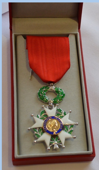
Legion D' Honnuer