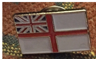
White Ensign Pins