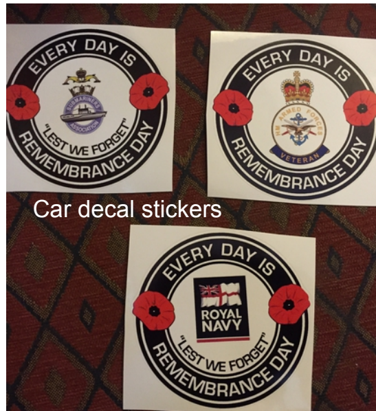
Car decal stickers

Please contact shipmate Blake to purchase these items or S/M Mike Rubery for bespoke orders of coasters and key rings