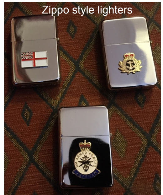
Zippo style lighters