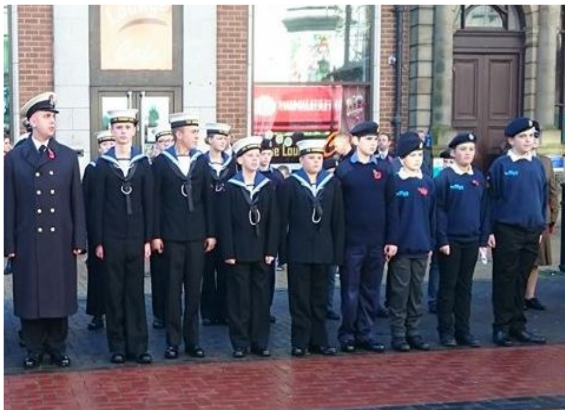
Bridlington Sea Cadets on parade

President of Bridlington branch Royal Naval Association