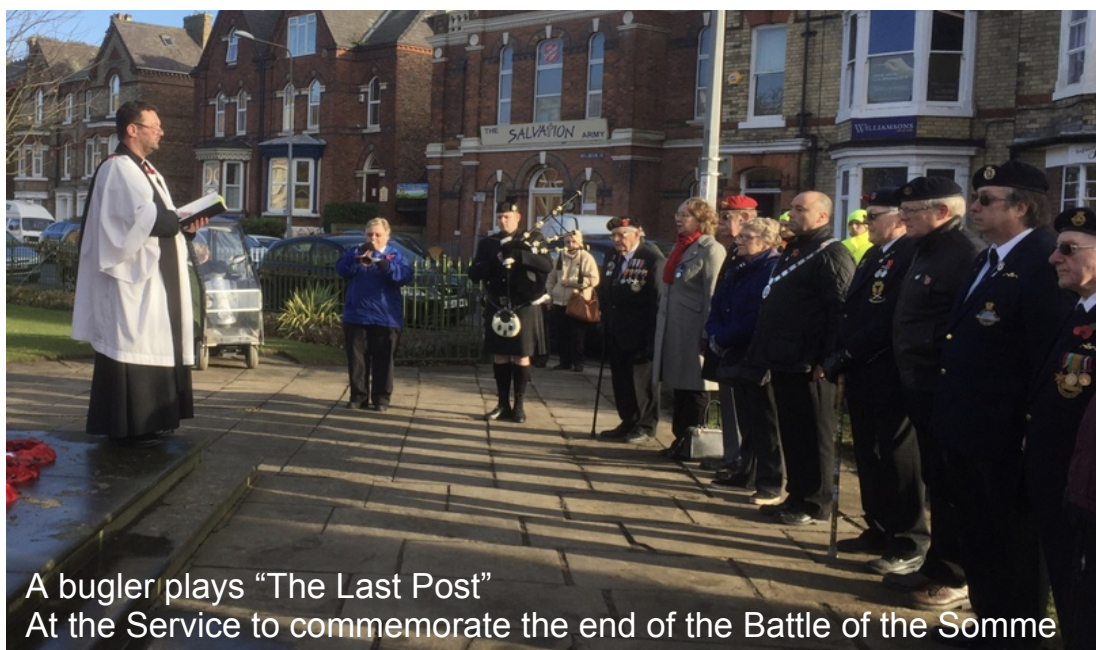
A bugler plays "The Last Post" At the Service to commemorate the end of the Battle of the Somme